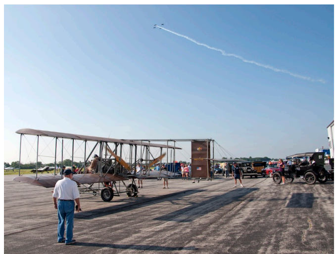
Wings and Wheels.