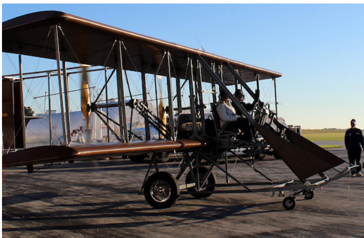
Ready to fly!