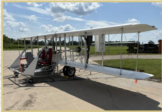
Out of the Container and Assembled