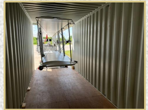
White Bird is Out