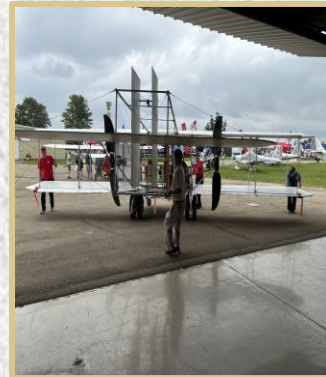
Entering the Home Builders Hangar