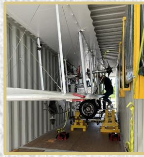
Unload the White Bird