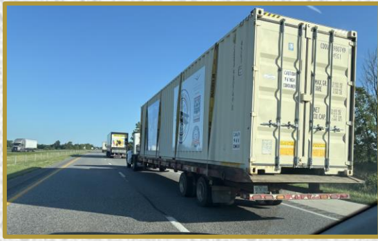
The White Bird Enroute to Oshkosh