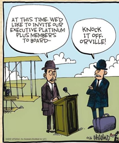
"Are we doing runway hops today."