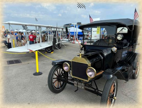
Our Display at the Dayton Airshow