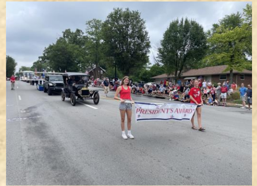
We won the President's Award at the Centerville Americana Parade